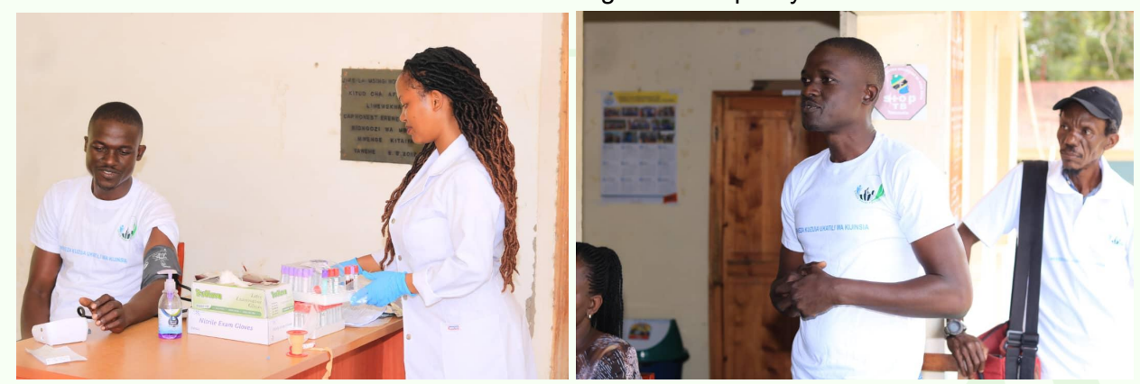
GMF Representatives actively participating in discussions and blood donation program 2023

Beyond financial support and logistical contributions, Green Masai Foundation actively engaged in the festival. Our representatives were present, partaking in discussions, workshops, and activities that aimed to address the root causes of gender inequality and violence.