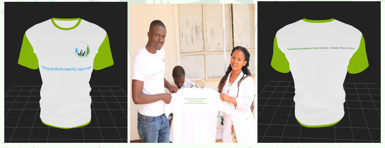
T-shirts for the advocacy of gender equality programs in Longido by Green Masai Foundation 2023

In a visual symbol of solidarity, Green Masai Foundation sponsored T-shirts for the event. Participants, organizers, and attendees proudly adorned these T-shirts, creating a united front against gender-based discrimination.