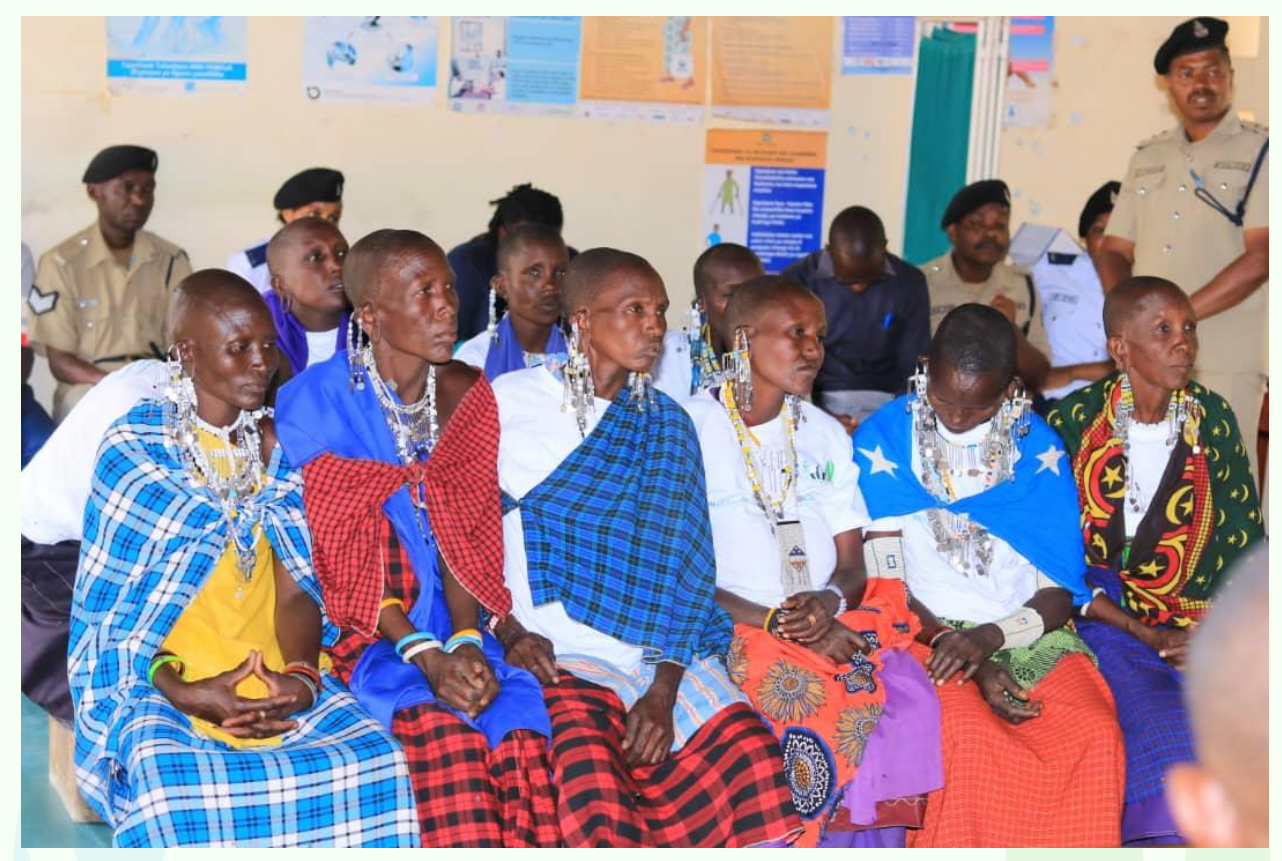
Vision for Gender Equality, Peace, and Prosperity

Longido, a land of vibrant culture and breathtaking landscapes, holds within its embrace a promise for a harmonious future. As we navigate the paths towards progress, it is essential to ensure that every individual, regardless of gender, finds opportunities for growth and fulfillment. The Green Masai Foundation, deeply committed to fostering positive change, is leading initiatives that lay the foundation for a more equitable and prosperous Longido.