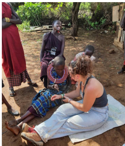
• Longido mountain adventure

"At Longido, our accommodations are not just resting spots; they are havens in the heart of the climb."