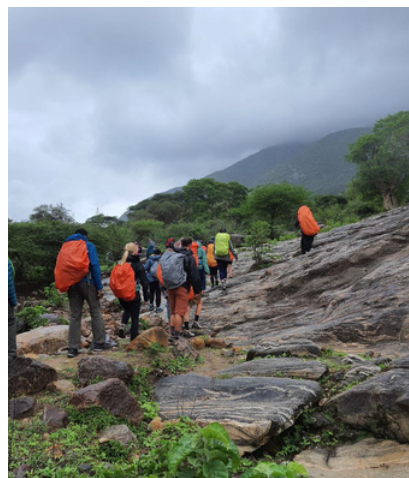
• Longido mountain adventure

"Immerse yourself in the pulse of Longido, where every interaction is a dance with Maasai heritage and warmth."