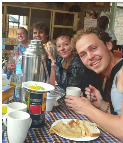
• Longido mountain adventure

2,690MT MOUNTAIN LONGIDO TREK OFFERED AT $150/ Package